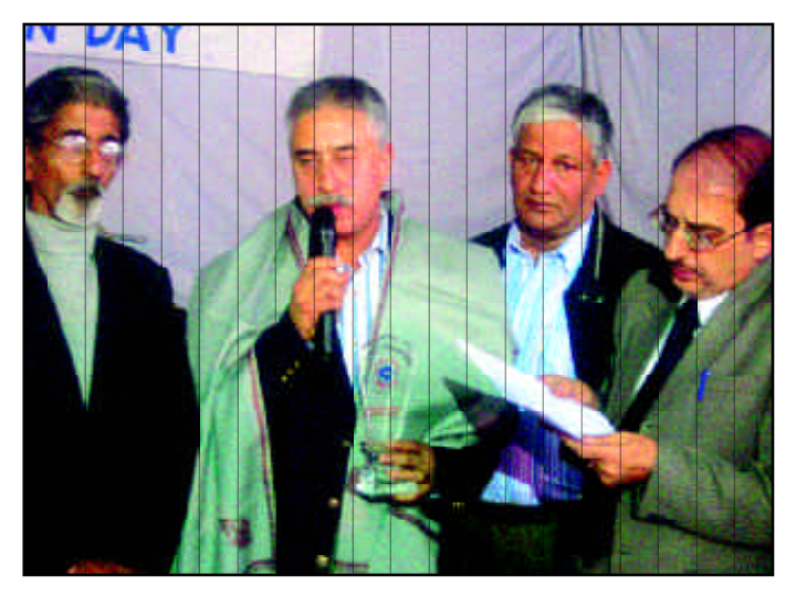
professional commitments for a private organization of repute.

various programmers and activities including impeccable mobilization of funds for scholarships/medical aid, temple project, magazine advertisements and other related areas. He took pre-matured retirement from a large public sector undertaking in 2005 and now most of his time is spent in dealing with worthy tasks of KKS-Gurgaon without holding any formal portfolio, in addition to his